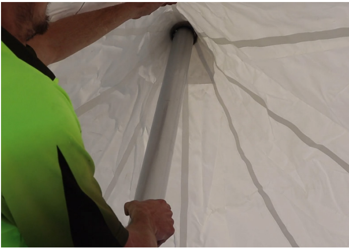
Position center pole in the peak of the roof