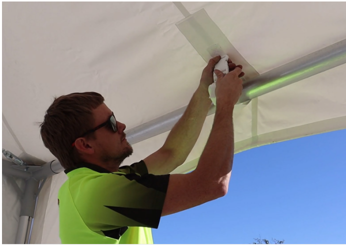
Attach roof straps around roof beams. Repeat on all sides.