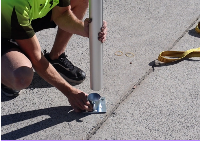
Attach steel foot to the bottom of Legs. Repeat on all sides.