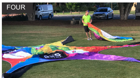
FOUR Inflatable Tent Accessories* Layout your Walls and Awnings and confirm positioning.