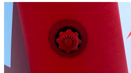
Over pressure relief valve system DO NOT TOUCH.

When the tent is in use, do not leave your tent unattended.