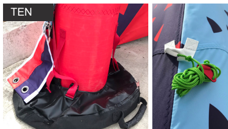
TEN Fix Stakes and Guide Ropes or attach Sandbags.