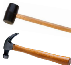
Hammer / Mallet