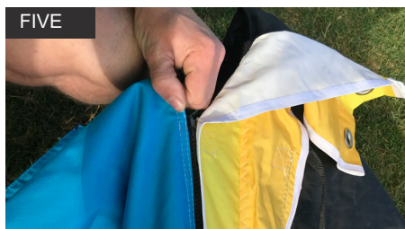
FIVE Attach the accessories using zips.