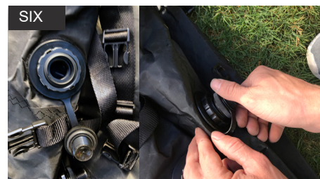
SIX Each leg on the Inflatable Tent has a valve. Select valve to attach pump, screw inflation valve closed and leave cap off. On all other valves screw tight and fix cap.