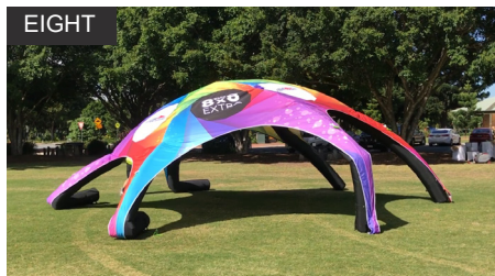
EIGHT During the inflation process raise legs into the center until all legs are upright.