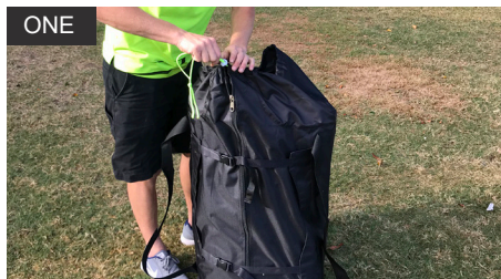
ONE Remove Inflatable Tent from Protective Cover.

Recommended procedure below. For safety reasons it is recommended that 2 persons set up any Inflatable Tent. Ensure area is free from any sharp objects & overhead objects.