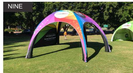
NINE Ensure all legs are lined up and canopy is centered. Check frame is firm.