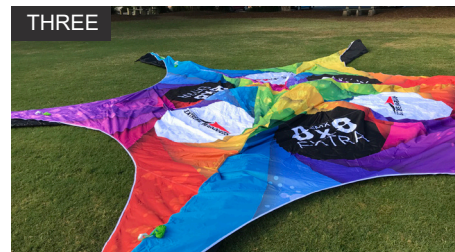
THREE Lay the Inflatable Tent out flat.