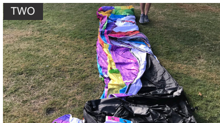
TWO Roll out the Inflatable Tent.