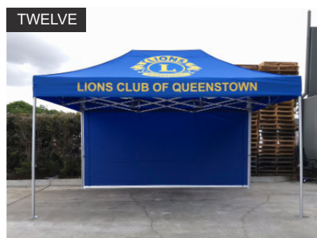
Finished Full Wall.