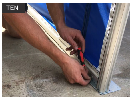
Insert Bar connection into the tracking on frame. Adjust the Bar as need to be level and in desired position, tighten bolts to secure. Repeat.