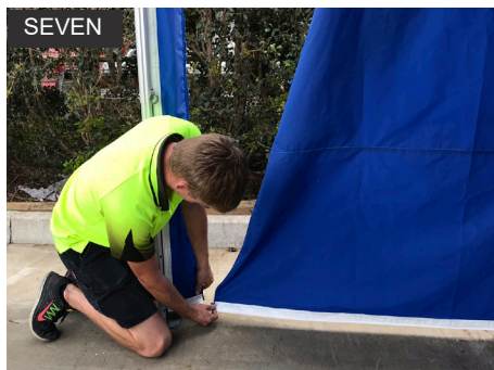
Zip the Wall Strip and the Half Wall Panel together. Repeat on other side.