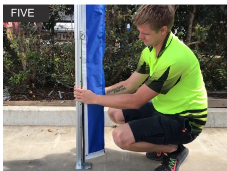
Press the Leg Rubber Inserts into the tracking on the Lower Leg of the Canopy. Repeat on other side.