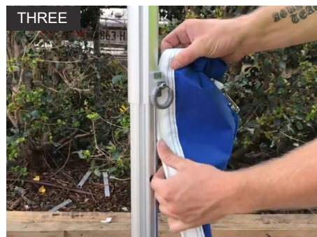
Insert the top of the Wall Strip Keda into the tracking of the Upper Leg of Canopy. (Hook facing inwards)