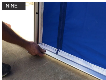
Bottom of Full Wall. Insert the Full Wall Keda into the Support Bar and slide Bar along fabric.