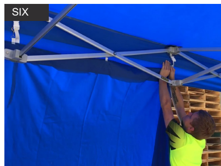
Full Wall Panel attach the Hooks to the Eyelets on Roof. Ensure Hook is facing inwards.