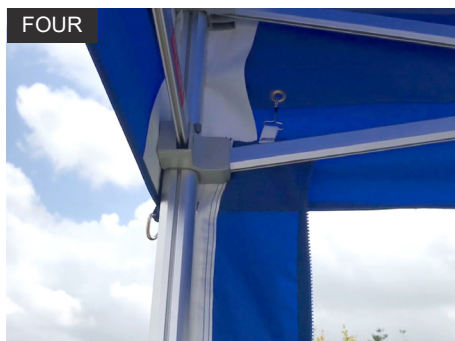
Attach the Wall Strip Hook to Eyelet in Roof. Ensure Hook is facing inwards. Repeat on other side.