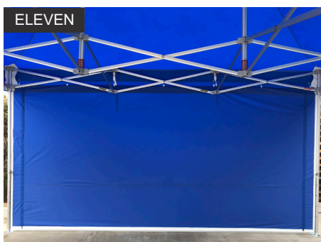
Finished Full Wall.