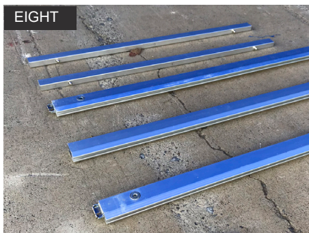
Assemble the Full Wall Support Bar for the bottom of the Full Wall.