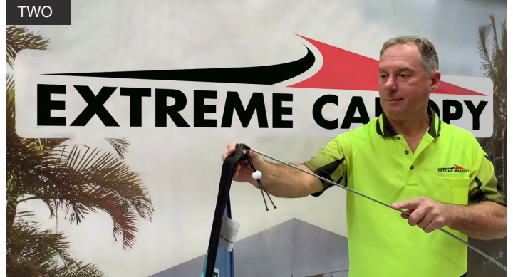
Insert the Flag Pole into the sleeve of the Flag fabric.