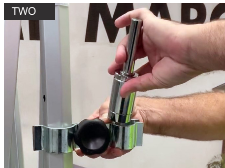
CANOPY LEG CONNECTOR Insert the Flag Spindle into the Connector, tighten the Connector until firmly fitted.