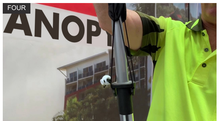
Attach the elastic from the Flag fabric to the Hooks on the Flag Pole.