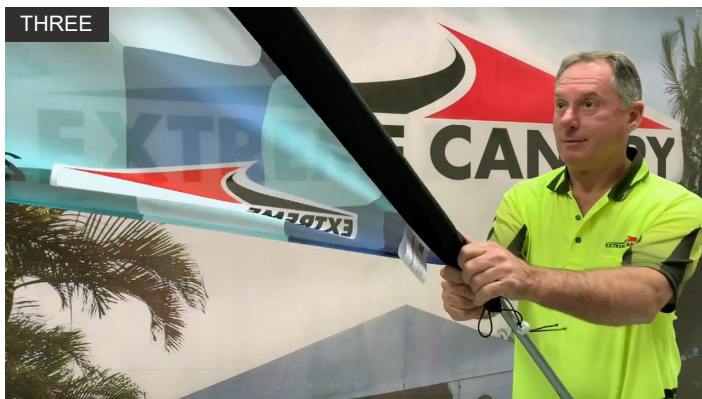
Applying even pressure pull the Flag Fabric to the base of the Flag Pole.