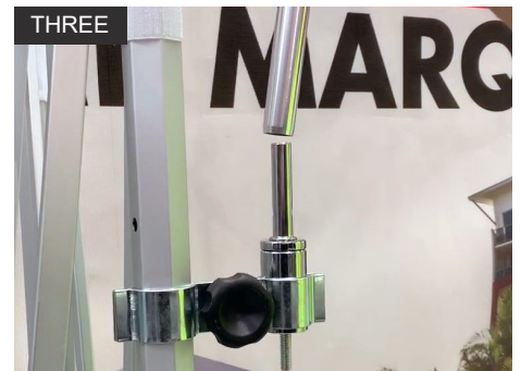
ALL BANNER BASES Position the Flag Pole onto the Spindle.