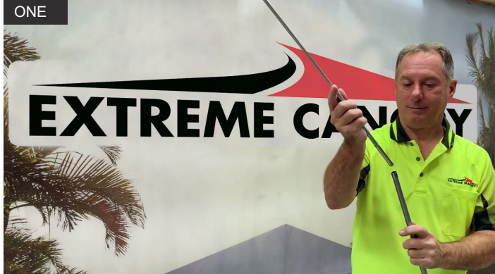
Assemble the Flag Pole. Small - 2 peices / Medium - 3 peices / Large - 4 pieces

Recommended procedure below. Ensure area is free from any sharp objects and overhead objects.